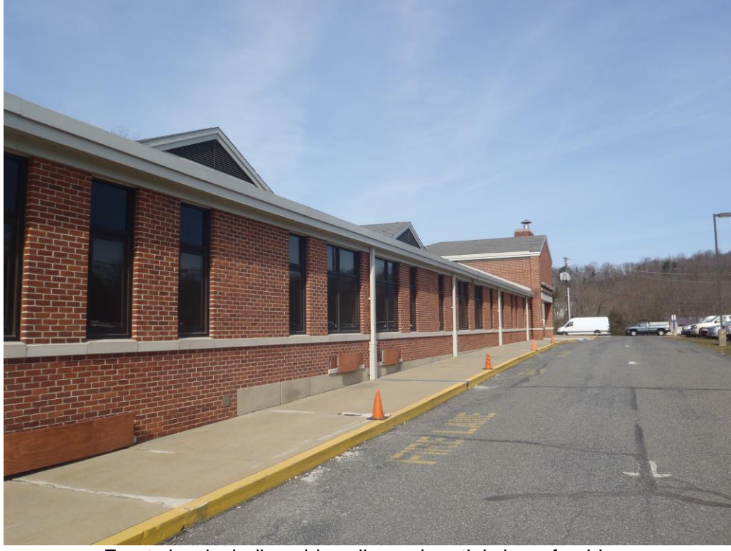
Front view including sidewalks and partial view of gables.