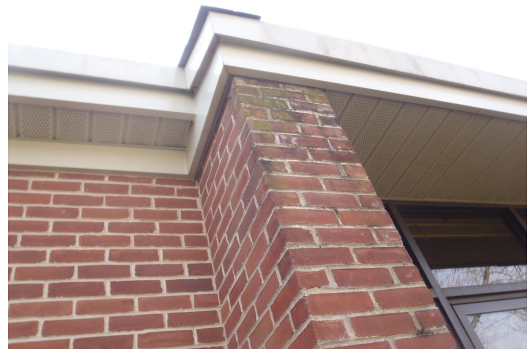
Masonry in area between wings exhibiting staining/loss of mortar resulting from excessive time between drying.