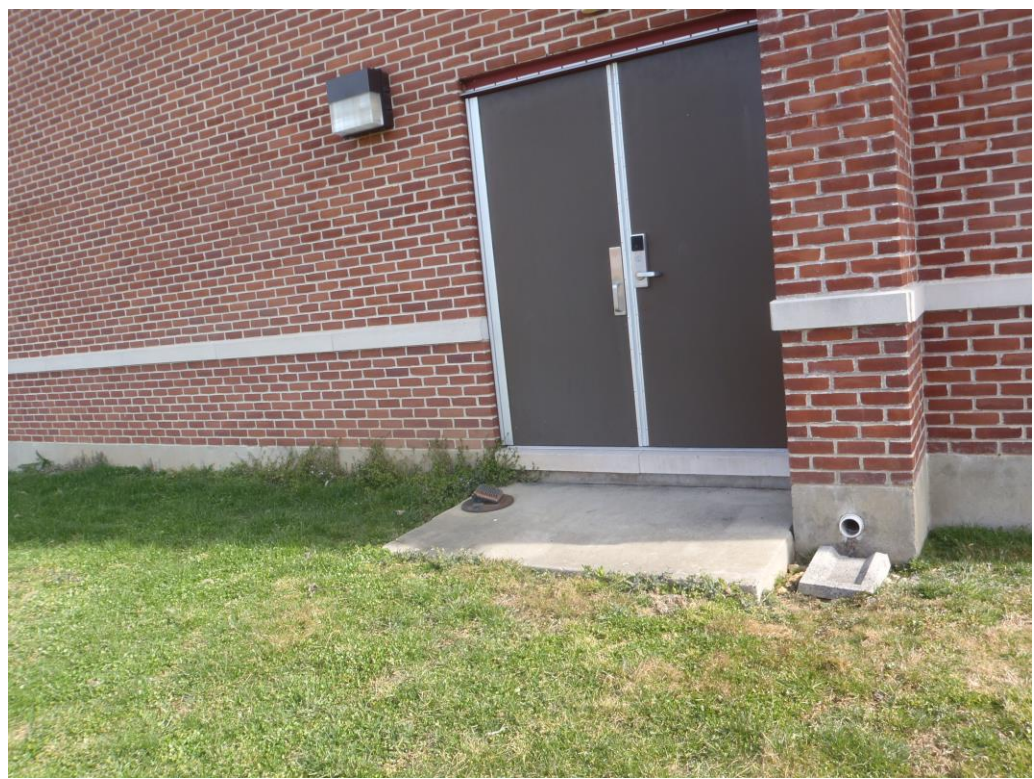
Side entrance. Note the step which limits accessibility.