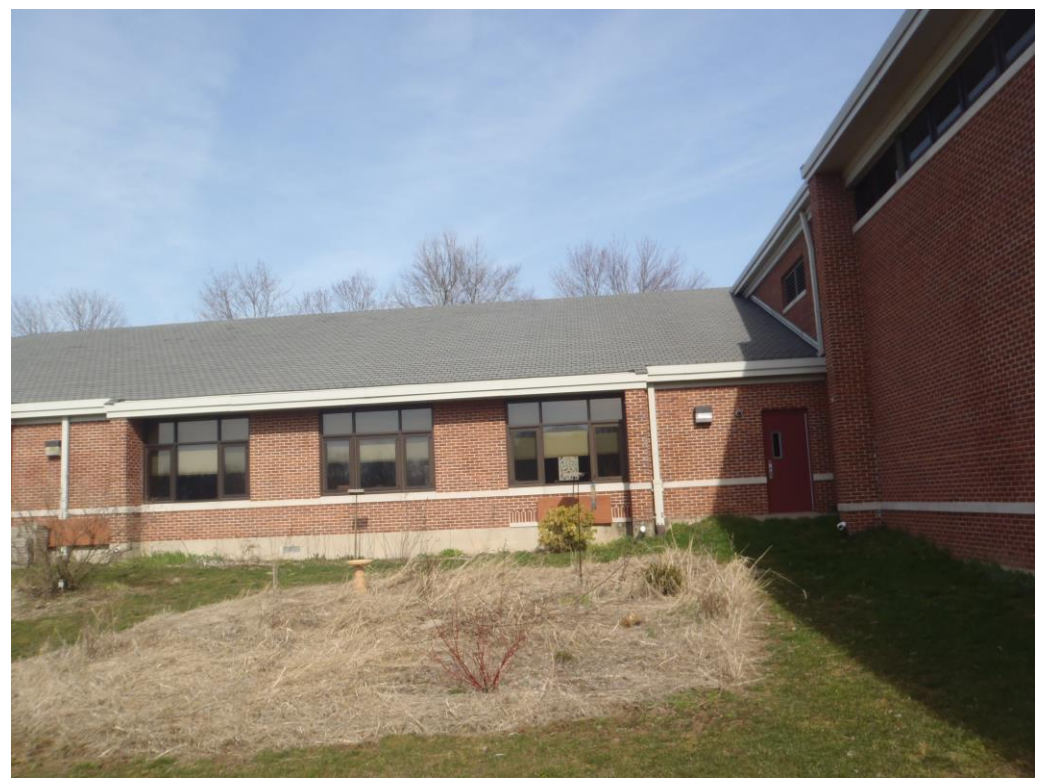
Roofing over wing from the courtyard