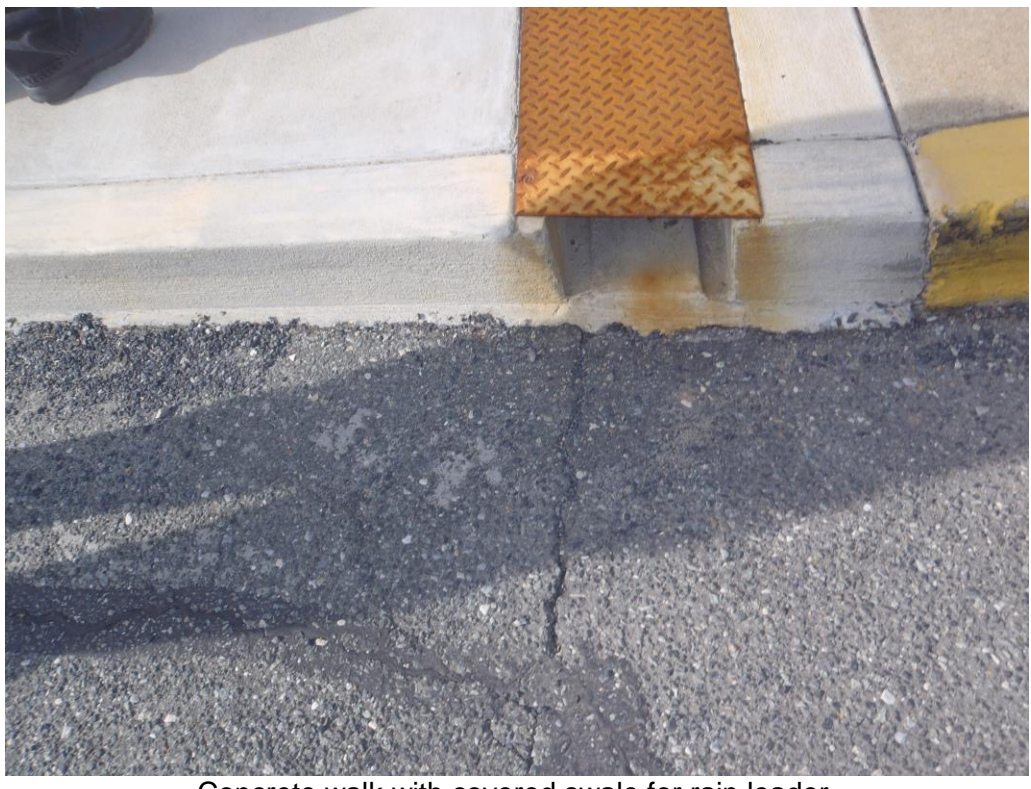
Concrete walk with covered swale for rain leader.