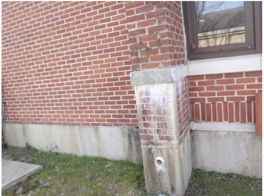
Soluble salts resulting from saturation of mortar of extended periods.