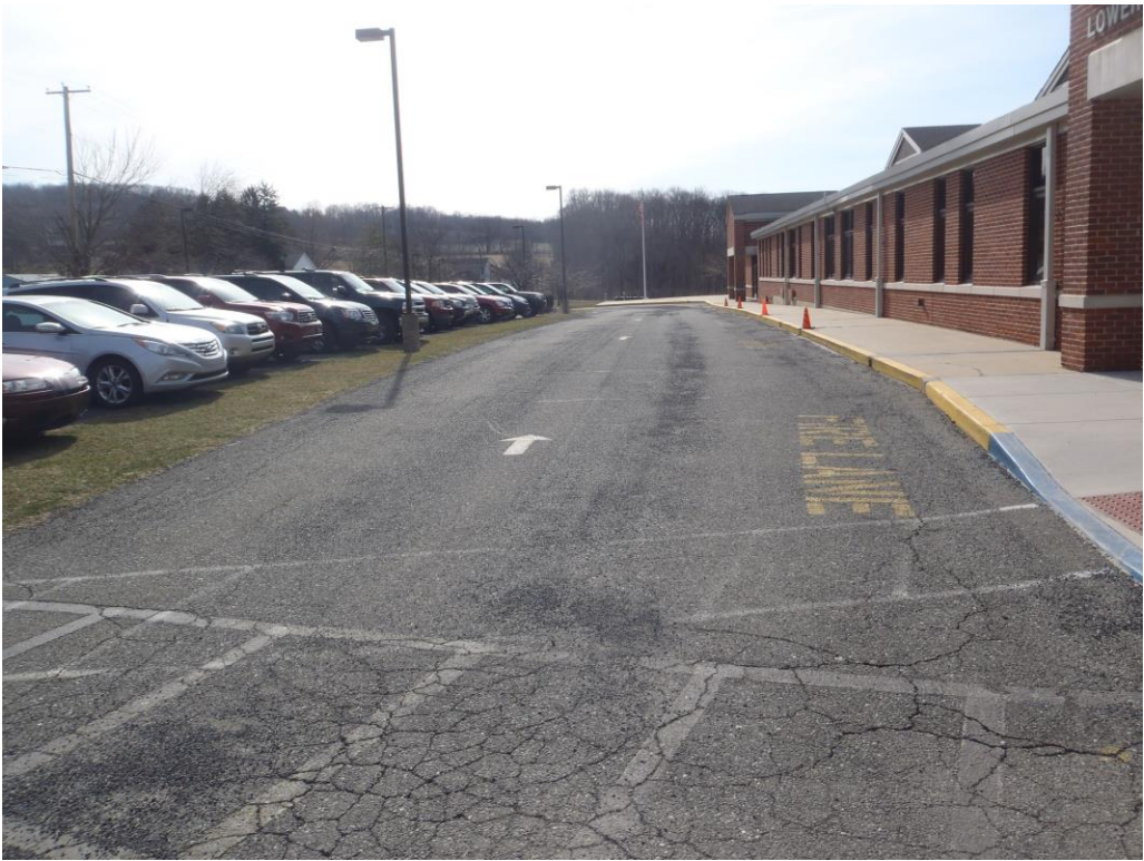
Asphalt paving, typical. Note the extensive alligator cracking.